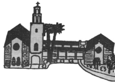
Faith Lutheran Church